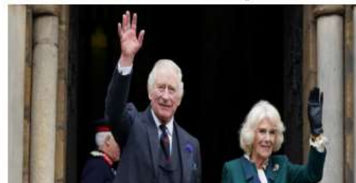
King Charles III and Queen Consort Camilla during the visit to Dunfermline and Edinburgh.

The Commonwealth community grew cold on the 8 th September 2022 following the passing of the Head of the Commonwealth Queen Elizabeth II, King Charles III succeeded as Head of the Commonwealth following a decision of Heads of Government at CHOGM 2018. Rwanda is currently the political lead as Commonwealth Chair-in-Office.