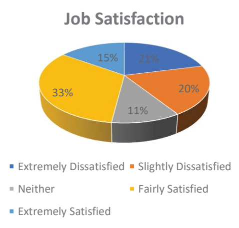
4 in 10 dissatisfied in their job