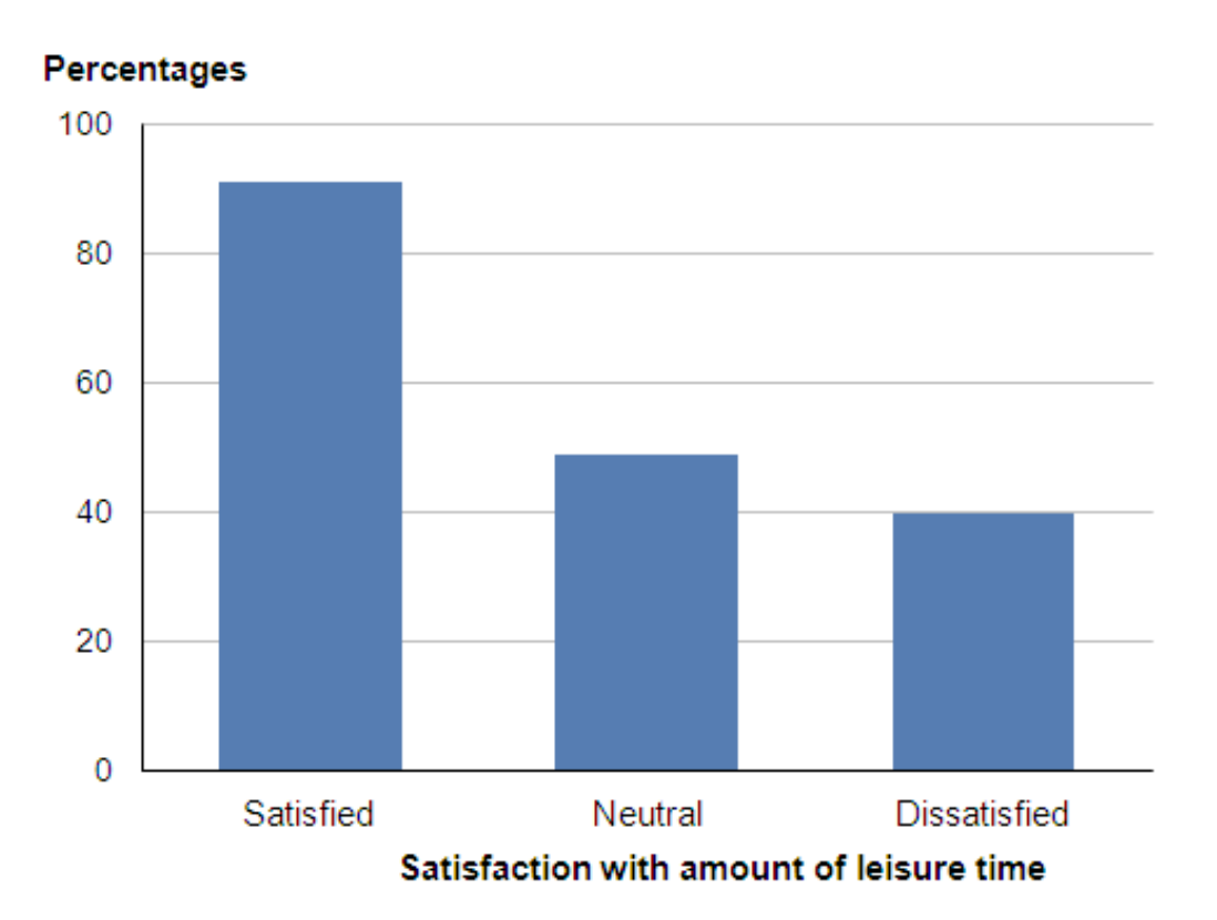
Figure 2: Satisfaction with life overall by satisfaction with amount of leisure time United Kingdom