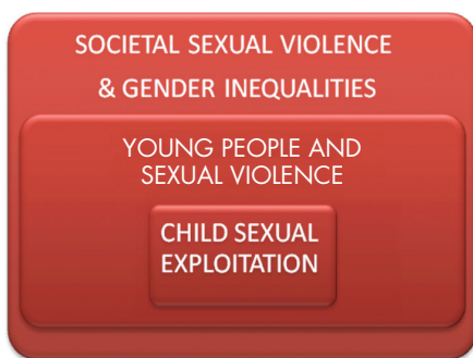
Figure 1.2: Sexual violence and exploitation

Sexual violence: The term sexual violence incorporates any behaviour that is perceived to be of a sexual nature, which is unwanted or takes place without consent or understanding (DHSSPSNI 2008). As illustrated in Figure 1.2 below it is a wider concept than that of child sexual exploitation that, when applied to the experiences of adolescents, should be done so with regard to wider societal structures of sexual violence and gender inequality.